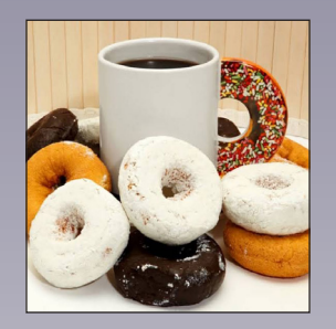
Sign Up for Coffee & Donuts

After Mass Hospitality (coffee and donuts) is a great way for new and returning parishioners to extend the celebration of Mass each week. We could use more helpers each month. The schedule is posted at our Sign Up Genius sheet—easily found on our homepage slider at <u>ollparish</u>. com. Consider how you might offer your time for Sunday Hospitality.